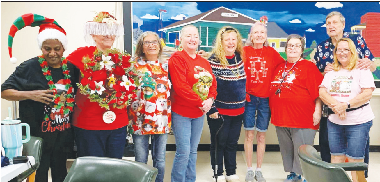
ABOVE: Dayton Seniors show off their holiday finery at the Ugly Sweater Contest.